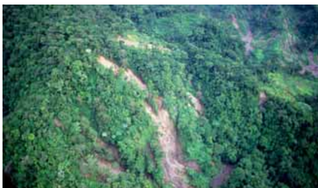
Landslides and soil erosion

Studies in Mt. Elgon Region indicate that landslides are exacerbated by extremes of climate, including the heavy rainfall, (Knapen et al., 2005). They complicate water management issues and lead to soil erosion, loss of arable land, food shortages and loss of infrastructure and human lives. Poverty limits efforts to contain the landslides. For instance, smallholders in Bududa working individually have no institutions or resources to embark on large infrastructure developments such as embankments and terraces to control erosion.