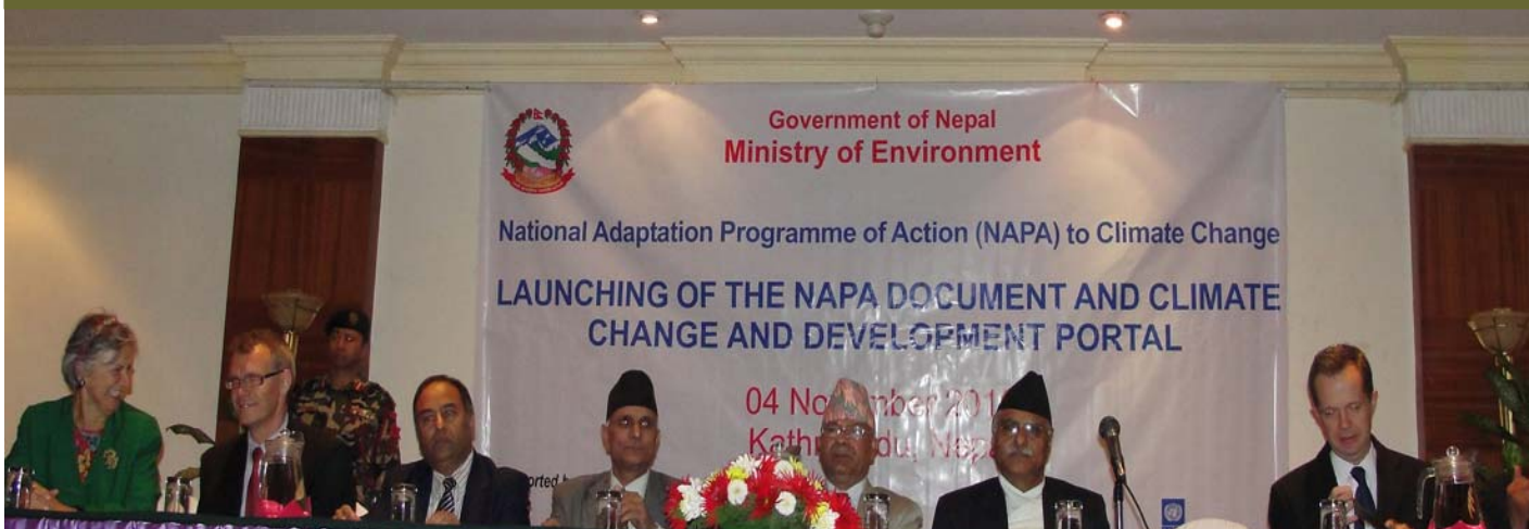
Rt. Honourable Prime Minister Mr. Madhav Kumar Nepal launches the NAPA

Following the Cabinet approval, Rt. Honourable Prime Minister and Chairperson of Climate Change Council, Mr. Madhav Kumar Nepal launched the National Adaptation Programme of Action (NAPA) document and the Nepal Climate Change and Development Portal , bringing to fruition an 18 months long effort involving six line ministries and more than 80 institutions across the country, including civil society, private sector and the media.