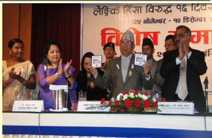
Rt. Hon'ble PM launching the CD on GBV Declaration Year