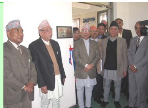
Rt. Hon'ble PM at the opening of NCCKMC

The center was established by the NAST in partnership with the Ministry of Environment, supported by DANIDA, DFID, GEF and UNDP as one of the complementary activities of the NAPA process and will support the implementation of the Action Plan. Currently, the center has a collection of over 700 publications but has plans to disseminate climate change related information to other districts by organizing campaigns, quizzes, lectures and exhibitions for students and the general public. The Center will work as the knowledge bank on climate change related information, scientific researches and policies, useful for decision making and development planning.