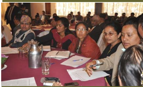
Women's caucus interact with the media

inclusive as possible and expressed their commitment to work together to bring forward these issues to the public. A total of 50 journalists and 60 women CA members participated in this one-day workshop. A total of 196 women CA members form the caucus, out of the 601 member Constituent Assembly.