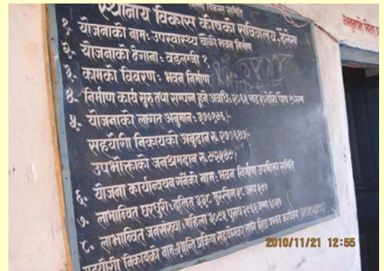
Information board outside sub health post with the details of project and expenses