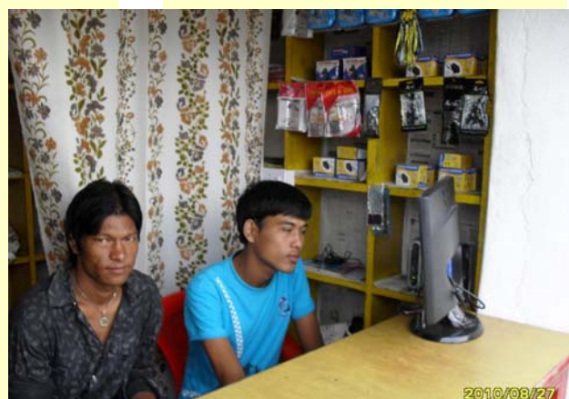
Proud owners of Rara Mobile Repair Centre

programmes, 368 have completed the training programme in vocational skills and micro enterprise packages.