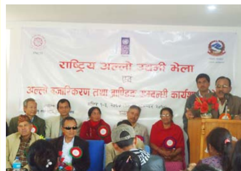
National workshop of Allo entrepreneurs