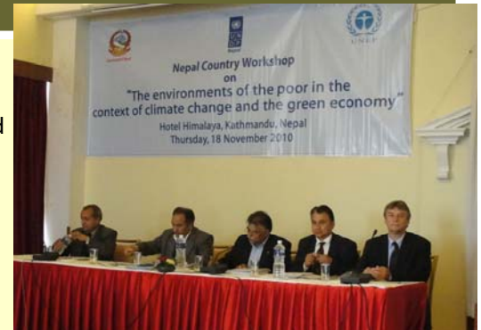
Opening of the PEI workshop

The papers were critically examined by the experts to dig out what can be really applied for future course of actions under the Poverty Environment Initiative in