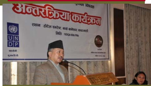
Chairman of the CA, Hon'ble Subash Nembang