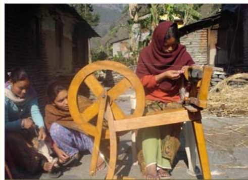
Weaving Allo thread in the spinning machine