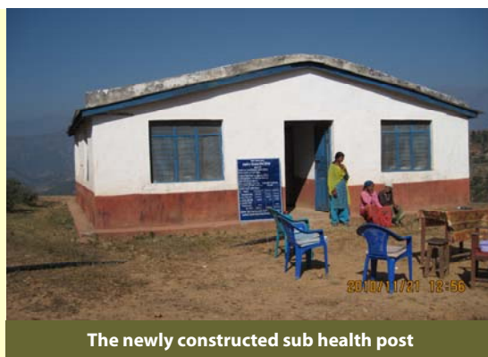
The newly constructed sub health post

Today there is a post delivery room and a waiting room for a family member attending the patient. A small toilet has been constructed at the cost of Rs. 9000 from the support of the Village Development Committee. Through the programme, adequate facilities are now made available in the new sub health post including two beds for child birth.