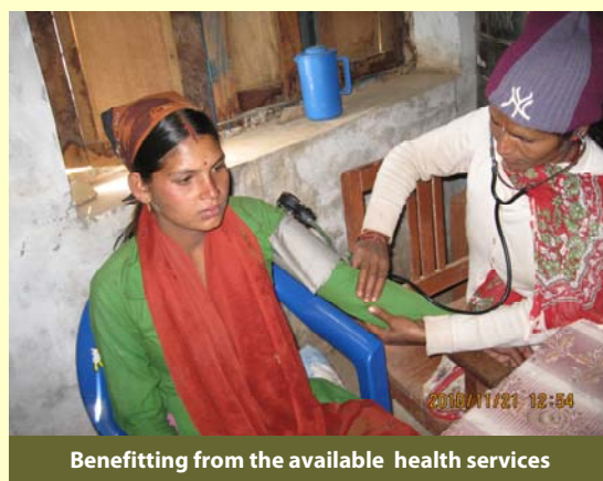
Benefitting from the available health services