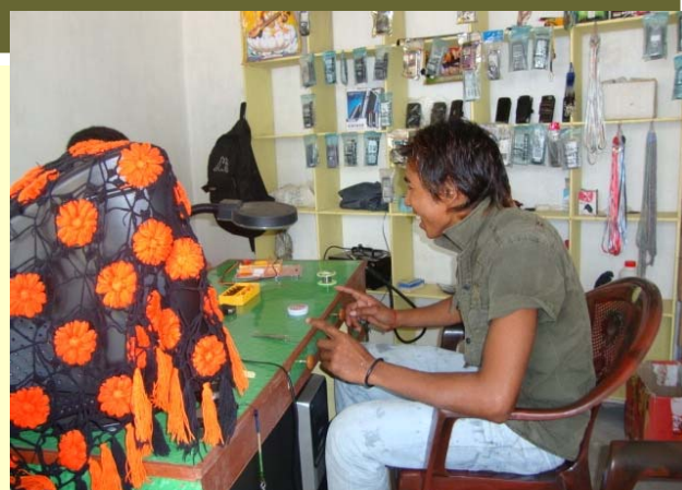
In a jolly mood at work !

A total of 1,144 have already started training in regional centers or are studying at schools close to their homes (32% of them female). Of the total number of participants who are in education and skills training