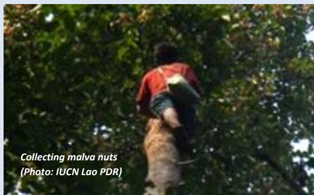
Collecting malva nuts

(For more information, visit the IUCN Lao PDR website at: www.iucn.org/lao )